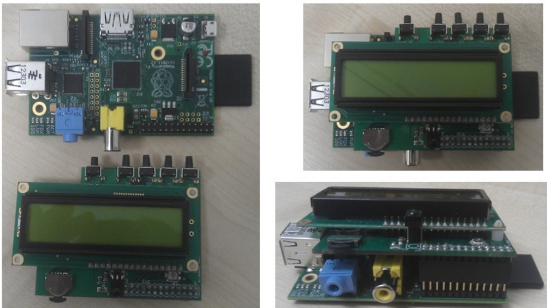
Figure 1: Raspberry Pi & PiFace Control & Display Setup